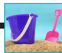
lead in the soil