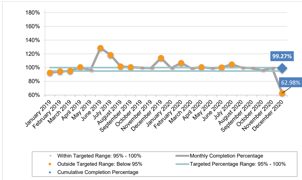
Chart 2. Magellan Health's monthly encounter submissions expressed as a percentage of payments submitted to the FAC to reported PIHP monthly CDJ payment