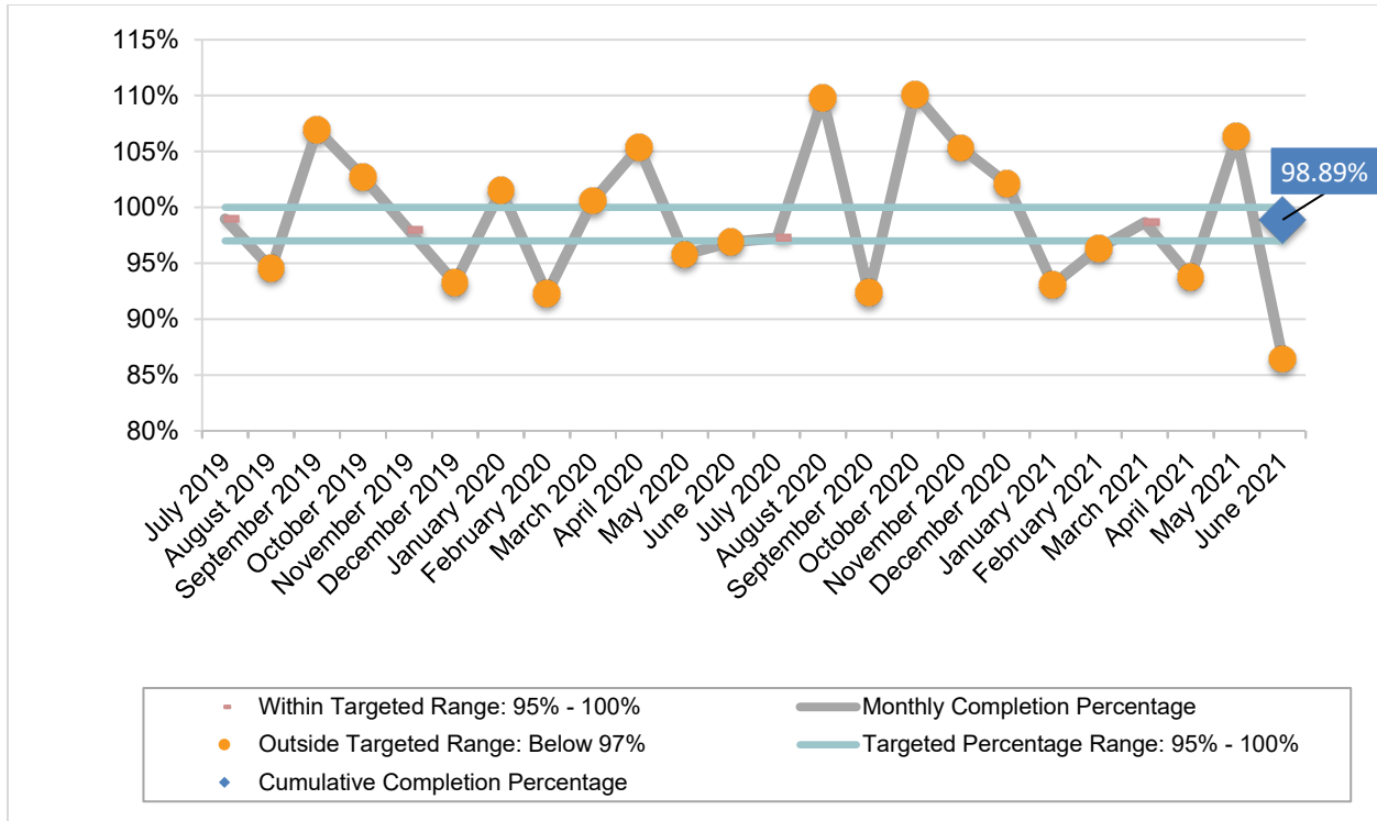
Chart 2. Health Blue’s monthly encounter submissions expressed as a percentage of payments submitted to the FAC to reported MCO monthly CDJ payment