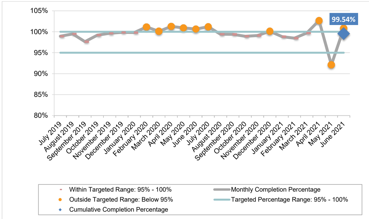
Chart 2. UnitedHealthcare Community Plans' monthly encounter submissions expressed as a percentage of payments submitted to the FAC to reported MCO monthly CDJ payment