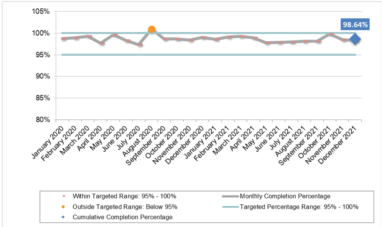
Chart 2. Louisiana Healthcare Connections’ monthly encounter submissions expressed as a percentage of payments submitted to the FAC to reported MCO monthly CDJ payment