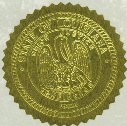
John Bel Edwards Governor

IN WITNESS WHEREOF, I have hereunto set my hand officially and caused to be affixed the Great Seal of the State of Louisiana, at the Capitol, in the City of Baton Rouge, on this 9th day of May A. D., 2023.