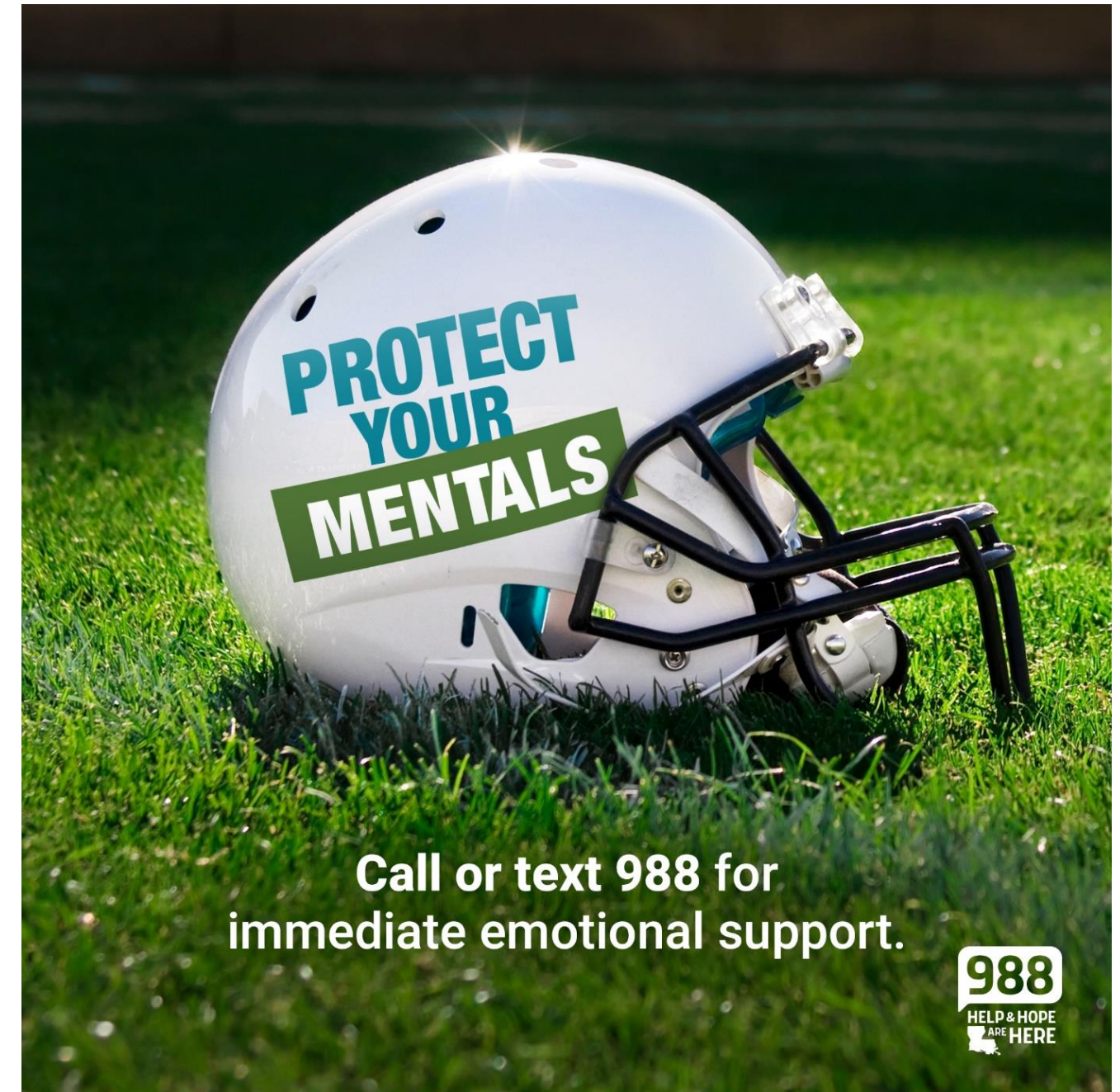
Louisiana 988 social media post