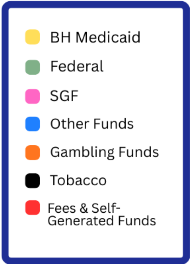
Estimated OBH FY 2026 Budget