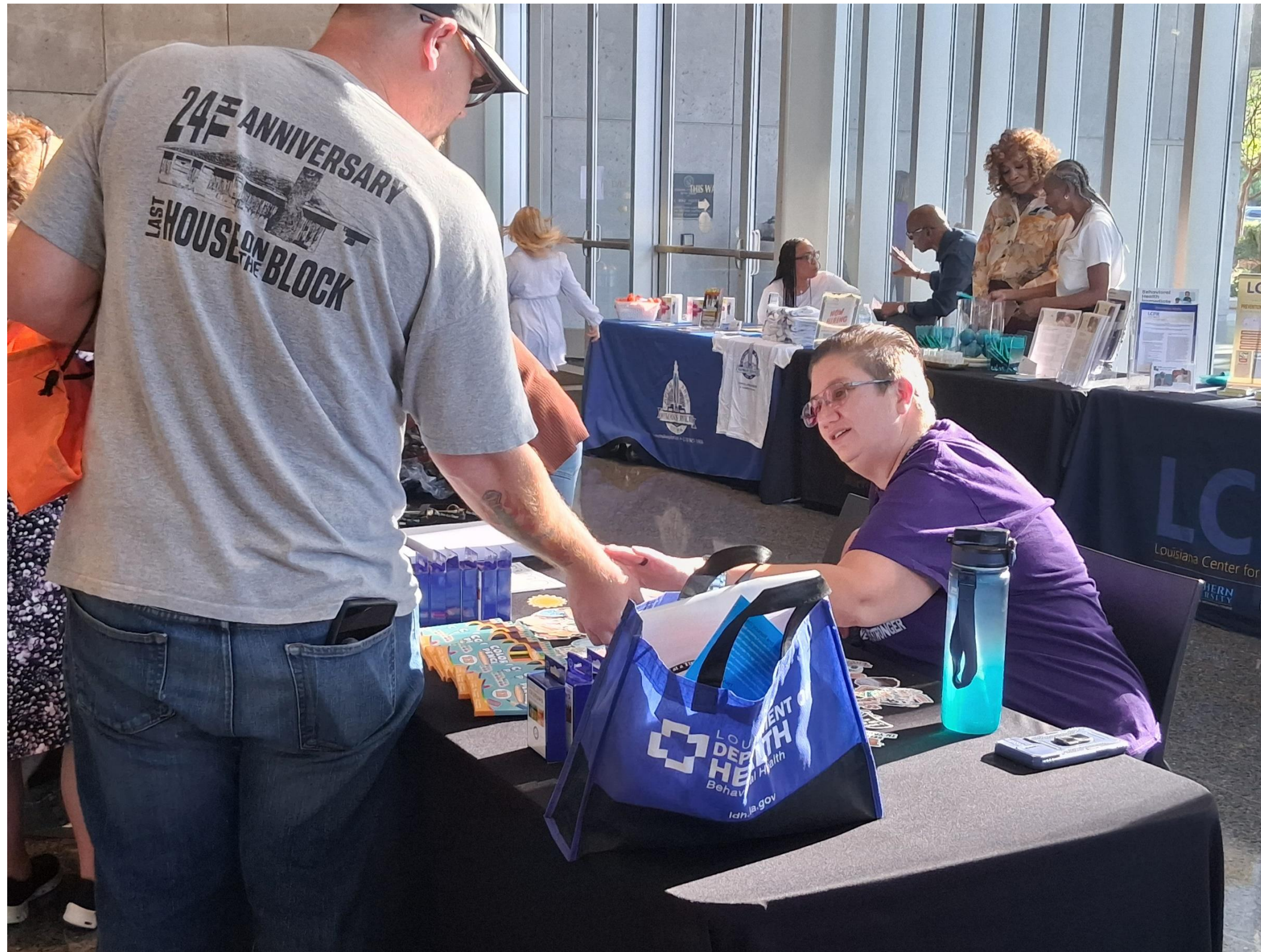
Recovery Month Celebration at the Capitol

Our commitment to ensuring everyone in Louisiana has access to quality behavioral health.