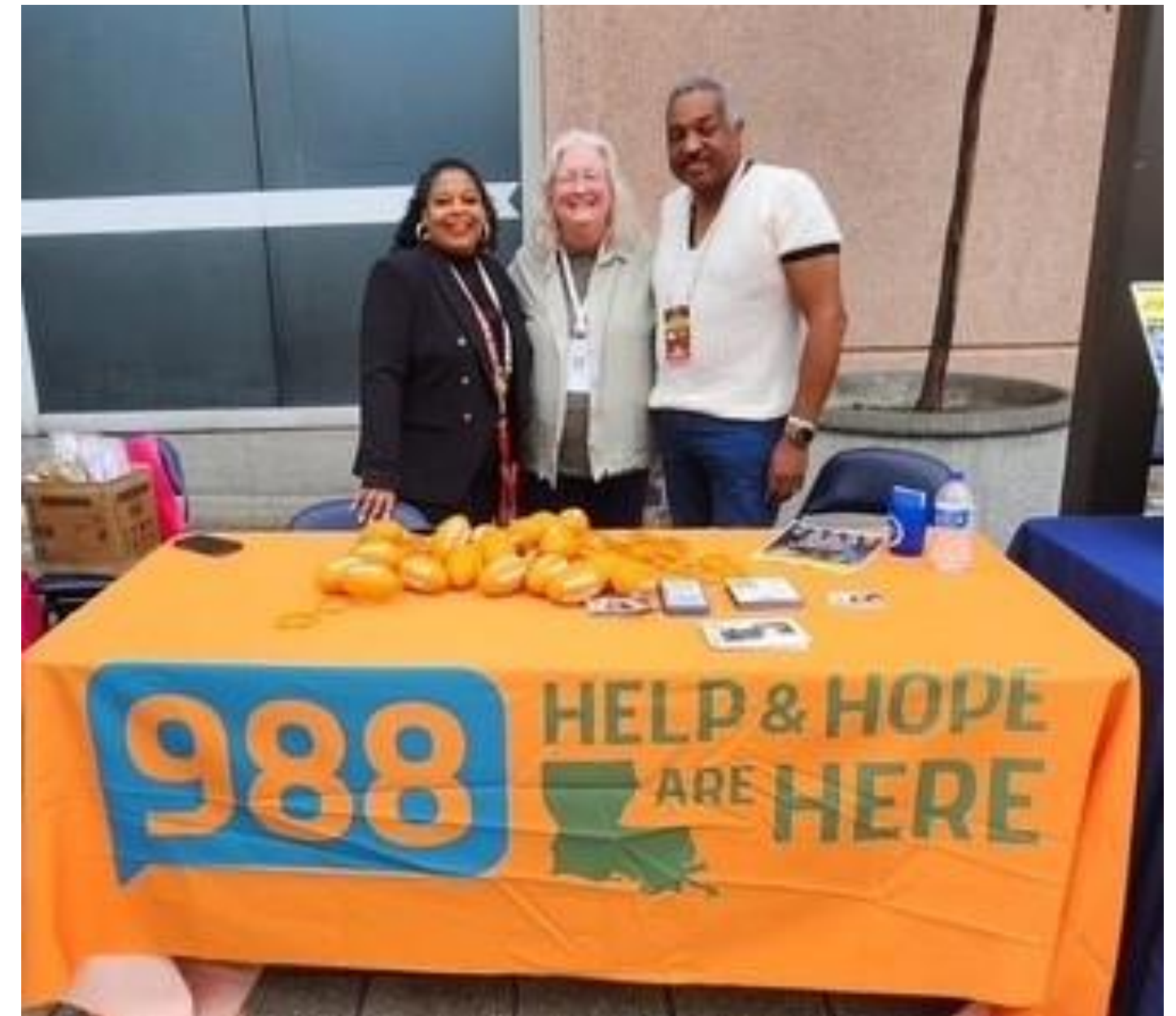
Louisiana 988 team members at an outreach event