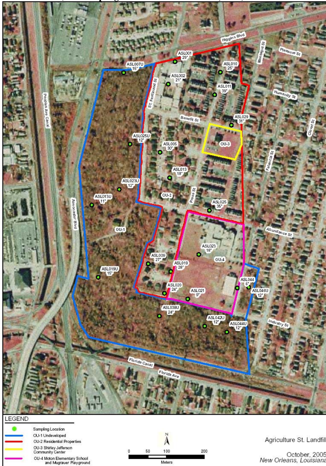
Figure 1. The Agriculture Street Landfill site boundaries (with sampling locations for October 1-2, 2006)

Adapted from: CH2M HILL, Inc. Hurricane Katrina Response: Agriculture Street Landfill, New Orleans, Site Inspection and Sampling Results. CH2M HILL Technical Memorandum 06-8459. 2006 Jan 30.