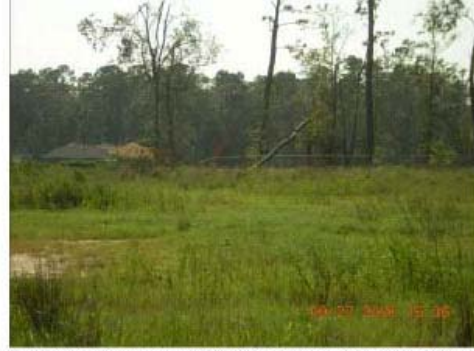
DSCN1247-DM_tree down across fence.JPG 2005/09/27 15:36:26