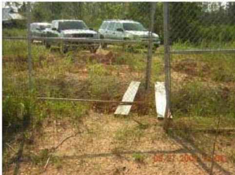
DSCN1258-DM_front gate.JPG 2005/09/27 16:06:10