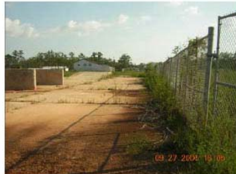
DSCN1257-DM_front gate.JPG 2005/09/27 16:05:44