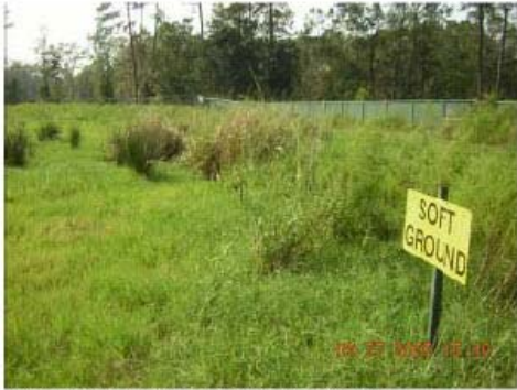
DSCN1248-DM_PRB.JPG 2005/09/27 15:40:03