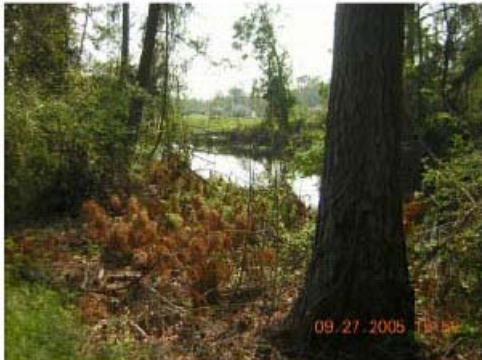
DSCN1256-DM_creek.JPG 2005/09/27 15:50:46