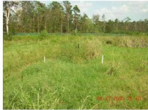
DSCN1249-DM_PRB.JPG 2005/09/27 15:40:30