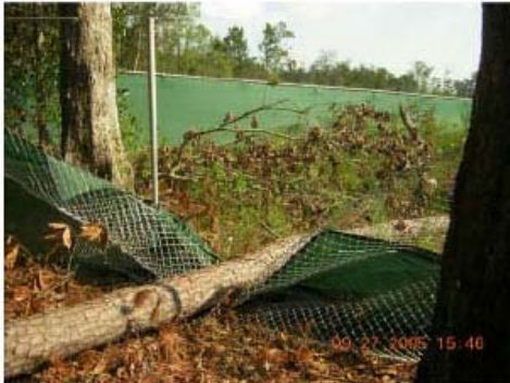
DSCN1252-DM_tree down on fence.JPG 2005/09/27 15:46:37