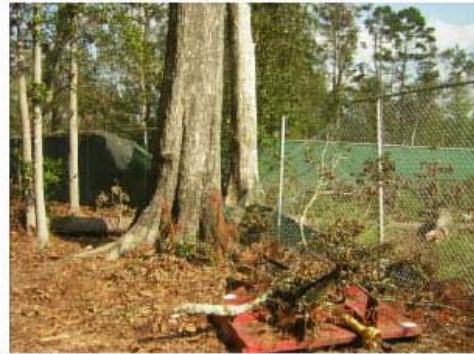
DSCN1251-DM_tree down on fence.JPG 2005/09/27 15:46:15