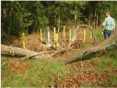
DSCN1250-DM_tree down adj to well outside fence.JPG 2005/09/27 15:46:15