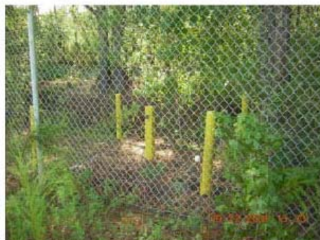
DSCN1245-DM_monitoring well outside perimeter fence.JPG 2005/09/27 15:30:00