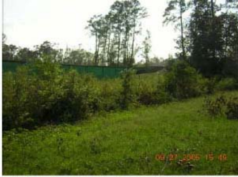
DSCN1254-DM_Perimeter fence_some view barrier damage.JPG 2005/09/27 15:49:46