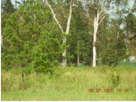
DSCN1246-DM_tree down across fence.JPG 2005/09/27 15:35:40