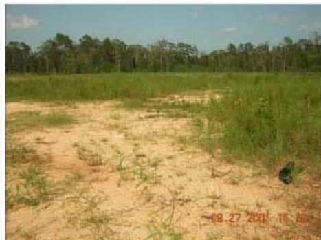
DSCN1243-DM_from front gate.JPG 2005/09/27 15:29:24