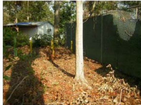
DSCN1253-DM_tree down on fence.JPG 2005/09/27 15:46:50