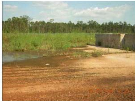
DSCN1241-DM_from front gate.JPG 2005/09/27 15:29:13