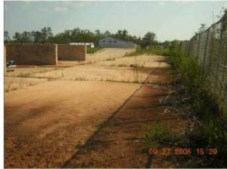
DSCN1239-DM_right from front gate.JPG 2005/09/27 15:29:02