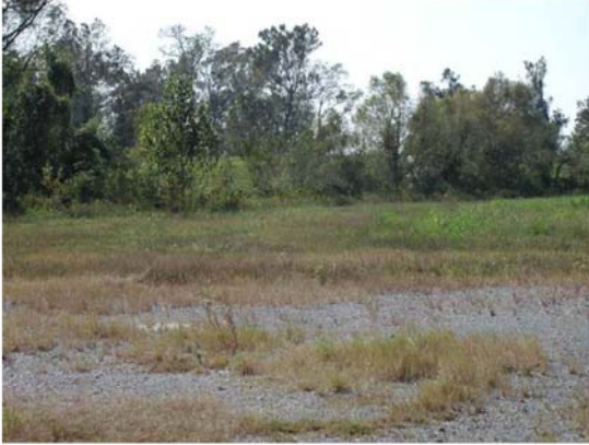
File Name: P1010057.JPG Date/Time Taken: 12 Oct 2005 1502 Description: Southeast corner of the site. Photo is looking southwest