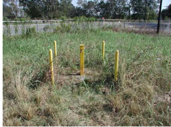
File Name: P1010058.JPG Date/Time Taken: 12 Oct 2005 1503 Description: Southeast corner of the site. Photo is looking southeast