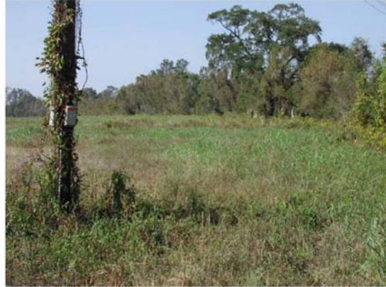
File Name: P1010054.JPG Date/Time Taken: 12 Oct 2005 1500 Description: Southeast corner of the site. Photo is looking north.