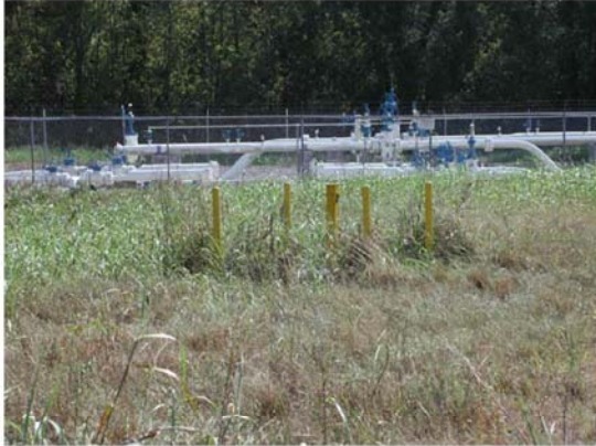
File Name: P1010053.JPG Date/Time Taken: 12 Oct 2005 1500 Description: Southeast corner of the site. Photo is looking south.