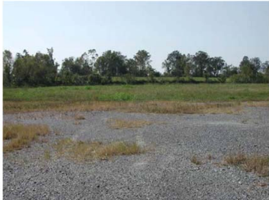
File Name: P1010056.JPG Date/Time Taken: 12 Oct 2005 1501 Description: Southeast corner of the site. Photo is looking west