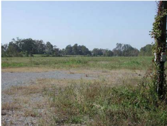
File Name: P1010055.JPG Date/Time Taken: 12 Oct 2005 1501 Description: Southeast corner of the site. Photo is looking northwest.