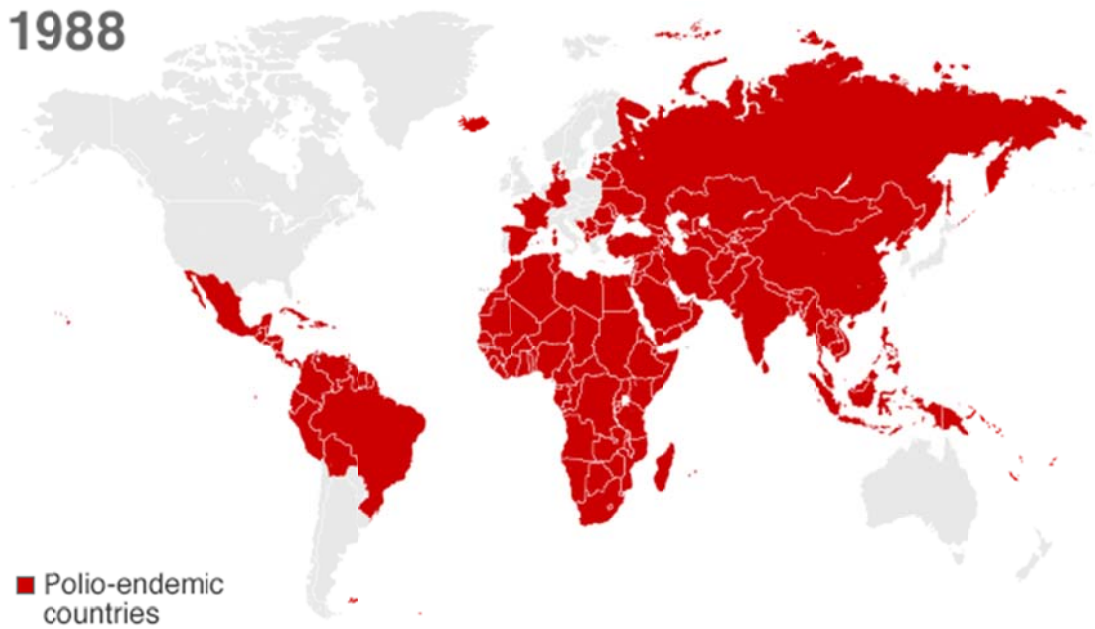
Figure 1: World-wide distribution of poliomyelitis, 1988