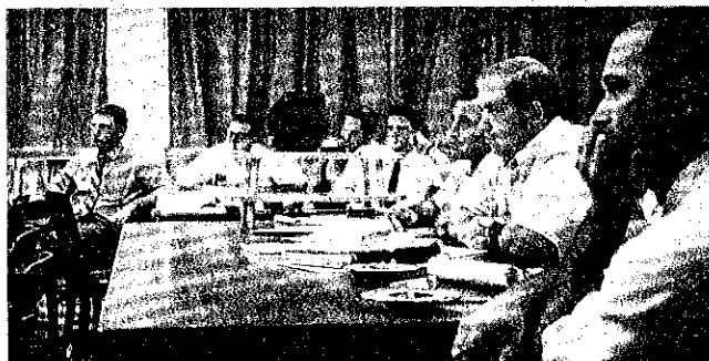
Thirteen sanitarians from 10 parish health units and the New Orleans Health Dept., completed a four week orientation course July 24 conducted by the Division of Sanitarian Services. This candid shot was taken during the first week