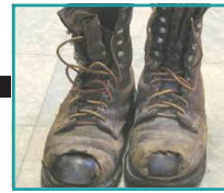
dirty work boots