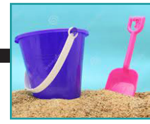
lead in the soil